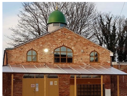
Coningsby St Michaels Church.